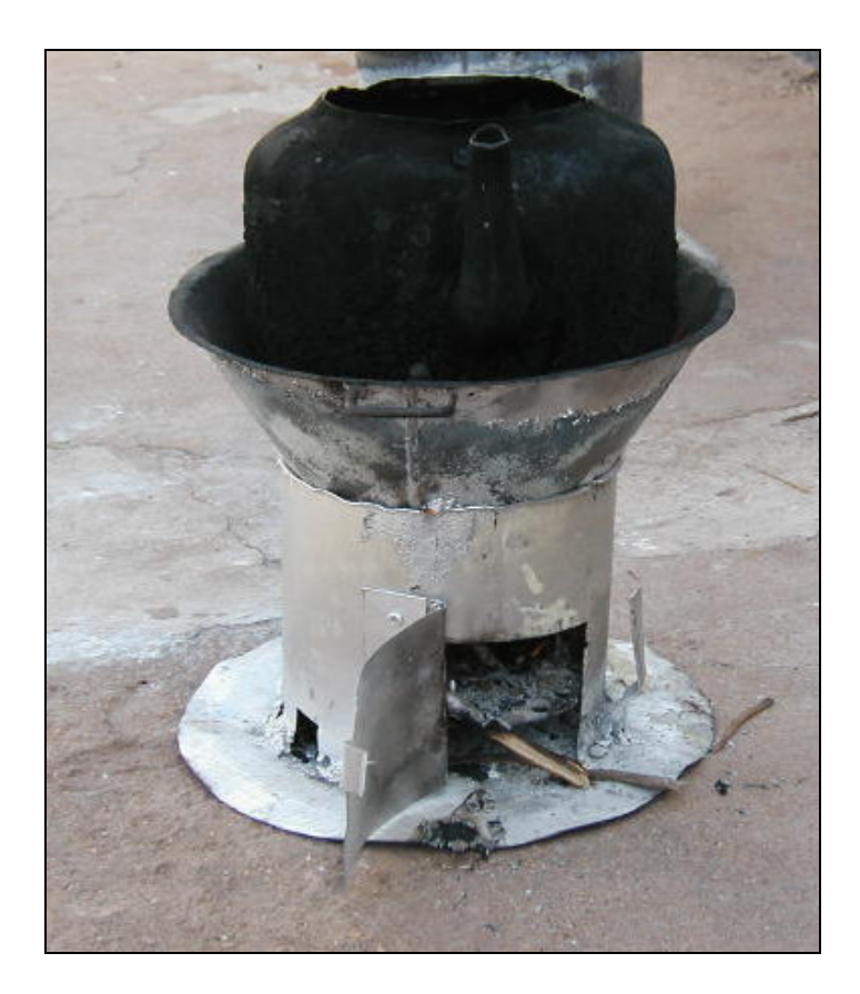
Figure 15. Stove with moderate-sized skirt.<sup>16</sup>

All other stoves that do not have skirts, aside from solar stoves, are judged for their potential risk for this hazard. Solar stoves do not need to be tested for this hazard and received a Best rating since food is often placed in a container or closed structure and cannot be "spilled out".