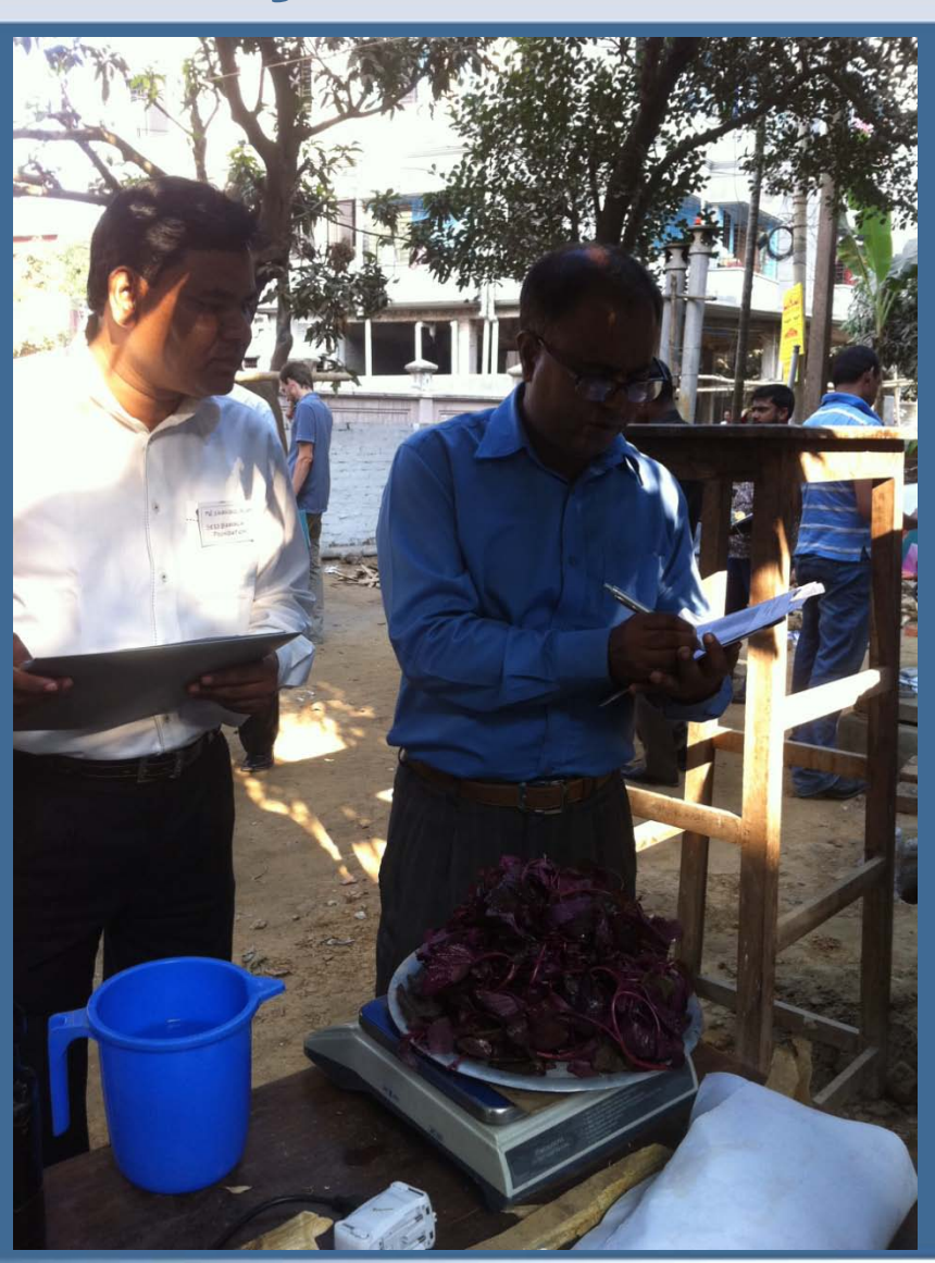
Partnership for Clean Indoor Air