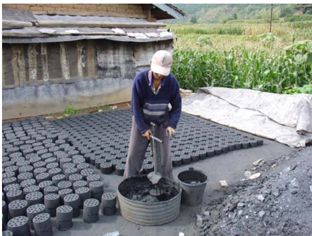
Production of Coal Bricks

The Ministry of Agriculture (MOA) has joined the PCIA and is interested in collaborating with other partners to address cultural barriers associated with household energy and health; commercialization of biogas digesters; and evaluation of household energy and health projects. The Ministry has 40,000 people engaged