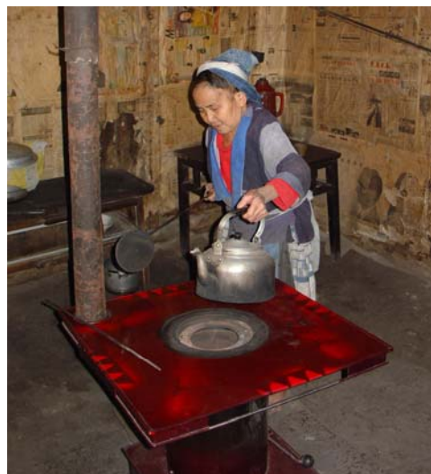
Woman Using Coal Stove

The IEHS sites in Xingren and Guiding counties in Guizhou rely on coal as the primary fuel source for cooking and heating. Guizhou is a relatively warm climate, so home heating is only necessary in the winter months. The coal in this region has a high