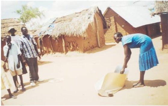
A happy user explaining her cooker to others

This is the scenario that SCI met when they arrived at the camp. Refugees were eager to try out a new type of cooking technology. After giving a few demonstrations using the food available, enthusiastic women were trained as trainers in the use of solar cookers. Through this dedicated group of trainers,