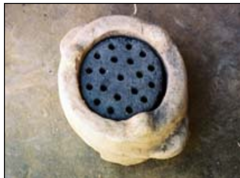
Honeycomb briquette in mud stove (above) and parabolic solar cooker (below) are among the options evaluated by

fuels and fuel technologies that could be appropriate for use in refugee and internally displaced people (IDP) camp settings, including fuel-efficient stoves, solar cookers, biogas, gel fuels and non-wood-based briquettes.