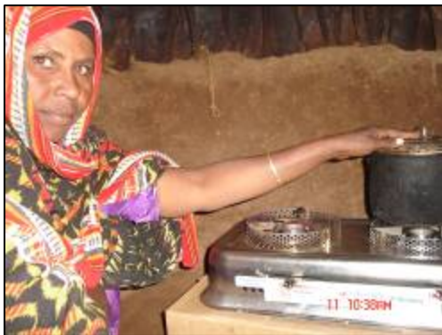
Refugee woman using ethanol fuelled CleanCook stove, Kebribeyah refugee camp, eastern Ethiopia.

One alternative energy source which has the potential to reduce environmental degradation and improve health in refugee communities is ethanol. It burns extremely cleanly with no smoke and very little soot. Ethanol can be used either as a gel fuel or a liquid fuel and appropriate stoves designed specifically to burn both are currently being pilot tested in several countries in Africa. An ethanol fuelled stove known as the "CleanCook" stove is currently in use in 800 households at Kebribeyah refugee camp, eastern Ethiopia and, to date has proven to be very successful. Significant reductions in IAP levels have been recorded and dependence on fuelwood as a cooking fuel has been reduced.