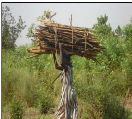
Young woman gathering fuelwood outside Bonga refugee camp, western Ethiopia

an activity which puts them at risk of injury, attack and rape. Since the end of 2006, tension and conflict have intensified between the refugees at Shimelba camp and the local settled community due to scarcity of fuelwood.