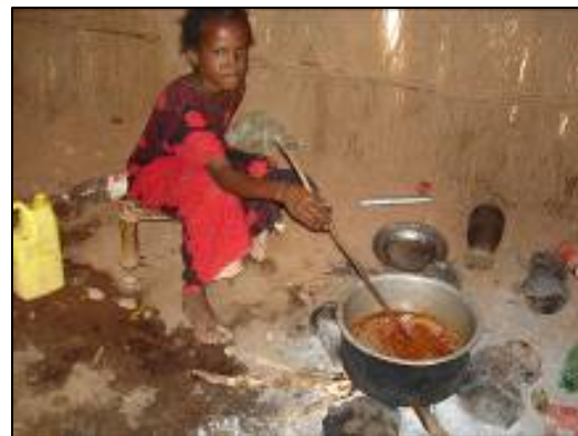
Young girl cooking on a three-stone fire, Kebribeyah refugee camp, eastern Ethiopia

The primary energy source in most refugee communities is biomass – namely wood or charcoal, and the main technique of cooking is by using a three-stone fire, a highly inefficient method of cooking which produces high levels of polluting smoke. The constant demand for energy can lead to or exacerbate deforestation, which may become unsustainable and result in the