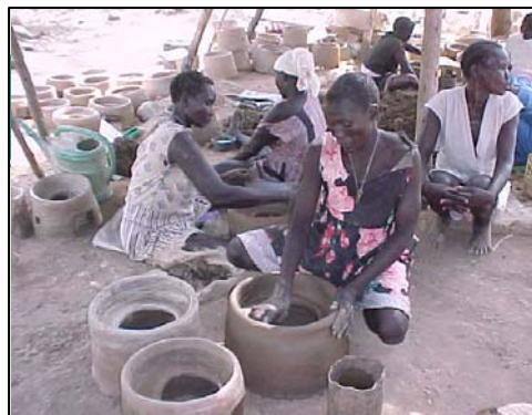
Women making improved biomass stoves at a refugee camp in Bonga camp, Ethiopia.

2002, p 13). Sudanese refugees in Uganda built mud stoves as part of a broader home improvement package which also included re-surfacing their floors and building pot stands and seats from the same material. Households began to compete over the most imaginative mud stove design and most creative kitchen accessories (Owen, 2002, p 13). Although they do reduce fuelwood consumption to some degree, the use of mud stoves does not significantly reduce fuelwood harvesting by refugee women or remove dangerous biomass smoke from the kitchen.