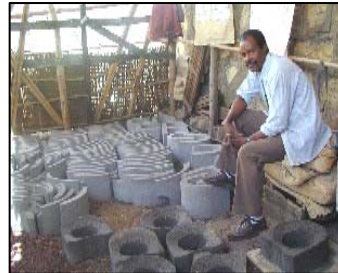
Mirt stove production, Ethiopia

zambique and Zambia, plus 520,000 stoves in new projects in eight countries (Benin, Burkina Faso,