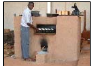
Rocket stove bakery, Uganda

last 20 years, mainly by the BMZ and complementary funding from European Union (EU), Shell Foundation, United Nations Development Programme (UNDP) and the Dutch Directorate for General for International Cooperation (DGIS). GTZ has opportunities for additional funding from DGIS of approximately € 11 million until 2008 and further € 7 million until 2011 (at the end of 2004, a Dutch-German