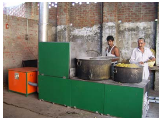
The Sanja Chula in India, cooking meals for school children. It runs on biomass briquettes, has a fan to assist the initial stages of combustion until it is hot and has replaced LPG.

There are two main issues relevant to carbon funding. Firstly, is the fuel used unsustainable? If wood is stripped for cooking faster than it is being replaced, then the biomass is unsustainable and there is a net emission of CO 2 . Our first project in 2003 supported NGOs in Bangladesh to extend their programmes. Although the intention had been to run the programmes in areas where the main source of fuel was wood indeed from unsustainable sources, it turned out that most users were using crop waste and twigs, which are renewable. Although the stoves reduced fuel used, it was much harder to prove emissions reductions. In Madagascar and Honduras we liaised closely with the project developers to ensure that the main fuel used was coming from non-renewable wood - being cut down and not replanted. We had to pull out of a fuel-switching project at an industrial plant in Costa Rica because we could not prove the source of the wood. In Madagascar there is anecdotal evidence