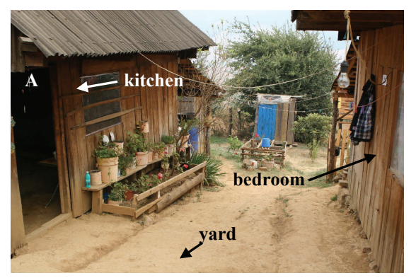
(Continued on page 6)

Methodology. The monitoring plan included: 48-hour measurements near the stove to analyze the effect of technology change, 48-hour measurements in the Main Plaza to have an average of local ambient and 24-hour measurements of personal exposure. Measurements of PM<sub>2.5</sub> were made near the stove using SKC pumps and cyclones, and a UCB monitor, for both the stove microenvironment and personal exposure. The objective was to analyze the reductions obtained