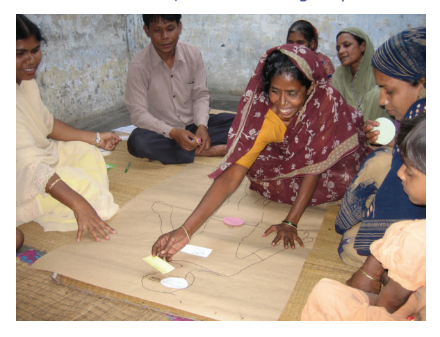
Women and children learn about the dangers of indoor air pollution in Bangladesh

will receive micro-credit seed funding to launch improved stove businesses. Appropriate stove models are being identified through VERC's innovative Methodology for Participatory Assessment (MPA), which has been adopted by the Asia Regional Cookstove Program (ARECOP) for improved stove programs. Concern Bangladesh is disseminating behavior change messages, primarily through their existing network of heath committees and volunteers, which were originally