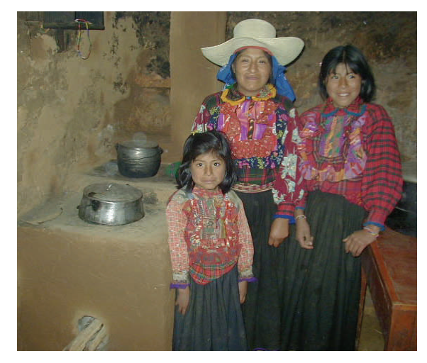
Proud Inkawasi family with improved stove

suited to the local barter system. A strong behavior change component facilitates awareness of the risks of IAP and the benefits of improved ventilation, cooking practices, and stoves with chimneys. Local promoters from 23 intervention communities are transmitting these messages to women and men from the participating communities. "Healthy Kitchen" competitions among households are providing further awareness raising and incentive for participation in kitchen improvements. Radio spots, murals and posters have been developed and disseminated at strategic times and places to reach a maximum audience.